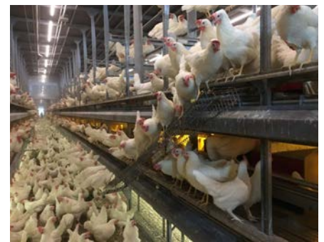
Figures 1 to 3: Conventional cages, enriched cages and aviary production systems