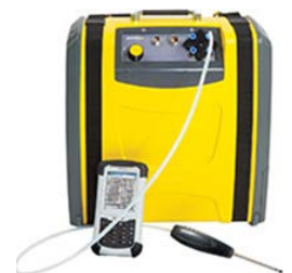
Figure 4: FTIR Gas Analyzer

The concentrations of ammonia ( \text{NH}_3 ) and three greenhouse gases (carbon dioxide - \text{CO}_2 , methane - \text{CH}_4 and nitrous oxide - \text{N}_2\text{O} ) were measured with an infrared gas analyzer (FTIR DX4040, Gasmeter). The air velocity, humidity and temperature were also measured using a telescopic multifunction probe (KIMO - VT 210 M) in order to calculate the airflow rate. The emission rate of each gas was then calculated using the concentration and airflow rate and expressed as mass per unit of time per hen.