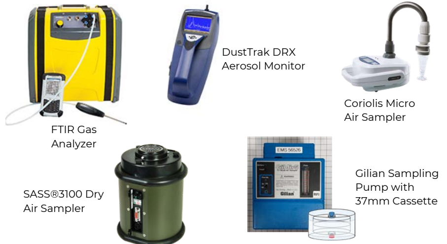
Figure 4: Sampling and analysis equipment

Barns were selected in the south of the province of Quebec with mechanical ventilation systems and a similar number of hens. Samples were collected in the fall of 2020 and winter of 2021. Specialized sampling and analysis equipment was used to measure gas emissions as well as dust and bioaerosol concentrations (Figure 4).